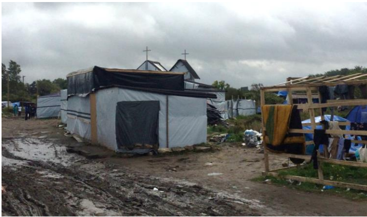
The church in the “Jungle” Camp, Calais

“The Church, guided by the Gospel of mercy and by love for mankind, hears the cry for justice and intends to respond to it with all her might.”