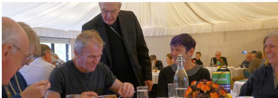
East Anglia launch, November 2019

CSAN held a major conference on Human Trafficking and Modern Slavery on 15th October 2019. We were delighted to have the support of CCLA as conference sponsor and host. Seventy-six representatives from the Catholic Church in England & Wales and other organisations shared and reflected on their experience in this field, to prepare new approaches and responses to what Pope Francis has called, “a scourge which continues to cause untold human suffering.” Cardinal Vincent Nichols joined experts from the fields of policy, frontline services, ethical investment and those working to eradicate the phenomenon from supply chains. Discussions concluded with a call for new directions based on the good work of organisations working with the Church. Cardinal Nichols concluded the event by saying: “The conference holds a great deal of promise and we need to work together to create a non-competitive, deeply respectful, shared vision.”