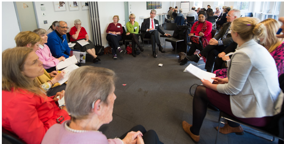
In Plain Sight, CNN